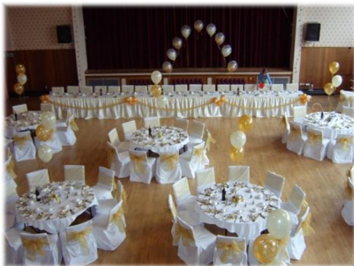
(Cabaret style for weddings)