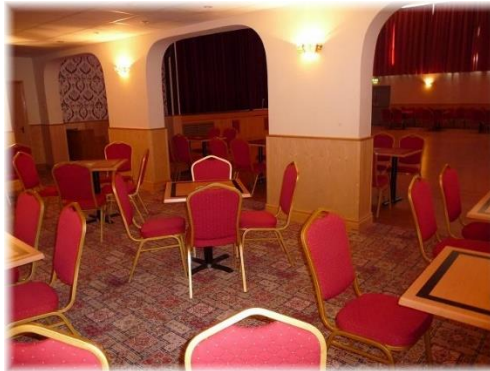
(Standard cabaret style)